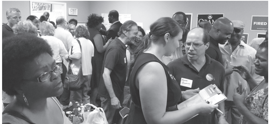
Campaign office grand opening: Greeting old friends, making new ones and signing up to volunteer. The office is at 17860 Mack Ave., Grosse Pointe, 586-343-1649. Hours are 10 a.m.-9 p.m. daily.

For updates, go to gpdems.com , the Grosse Pointe Democratic Club Facebook page and the campaign office Facebook page, Stronger Together - Grosse Pointe.